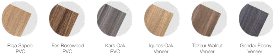
Riga Sapele PVC